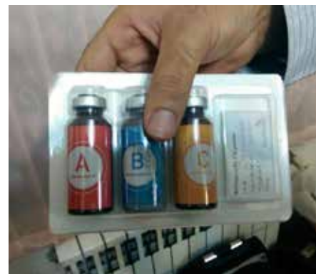
Figure 4. Bone reagent material (color coded).