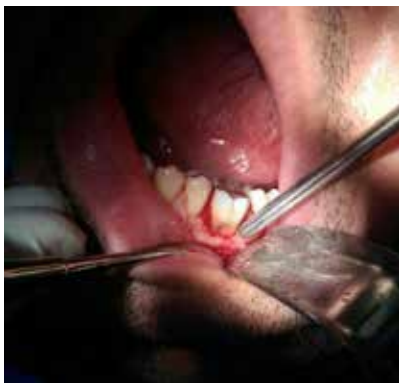
Figure 1. Left first molar mandibular before extraction

After 4 months, radiographic imaging showed desirable density in the area (Fig 6, 7). The Dentegris Implant System ( 4.5 \times 11 mm) was selected for the patient. (Fig 8) After infiltration injection of local anesthetic (Lidocaine with epinephrine (1:80000)), the fixture was placed with the primary stability of 15 N. After placing the cover screw, the flap was closed using absorbable suture. After three months, it was loaded with a metal-ceramic crown. The patient's 5-year follow-up showed good aesthetic, excellent osseointegration and little to no bone resorption, indicating the reliability of this autogenous graft material (Fig 9).