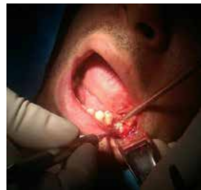
Figure 5. Placing the autogenous graft material.