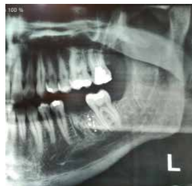
Figure 6. After 4 months, radiographic imaging showed desirable density in the area.