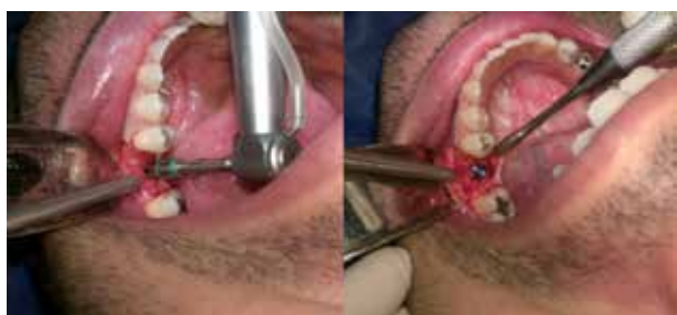
Figure 8. Placing the Dentegris Implant System (4.5 × 11 mm), the fixture was placed with the primary stability of 15 N. After placing the cover screw, the flap was closed using absorbable suture.