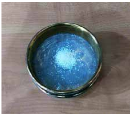
Figure 2. Tooth powder after several times of millings and siftings.