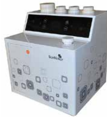
Figure 3. The Bon Maker system was used to provide tooth derived bone graft material.