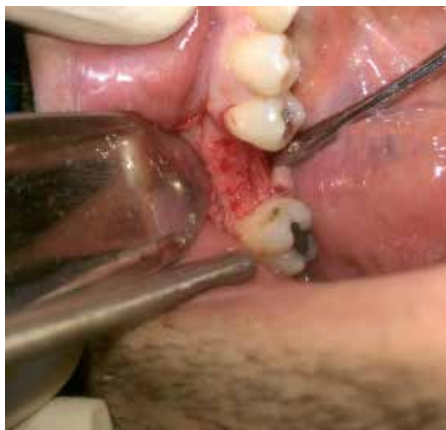
Figure 7. A good bone regeneration was observed after retracting subperiosteal flap.